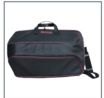
practical carrier bag